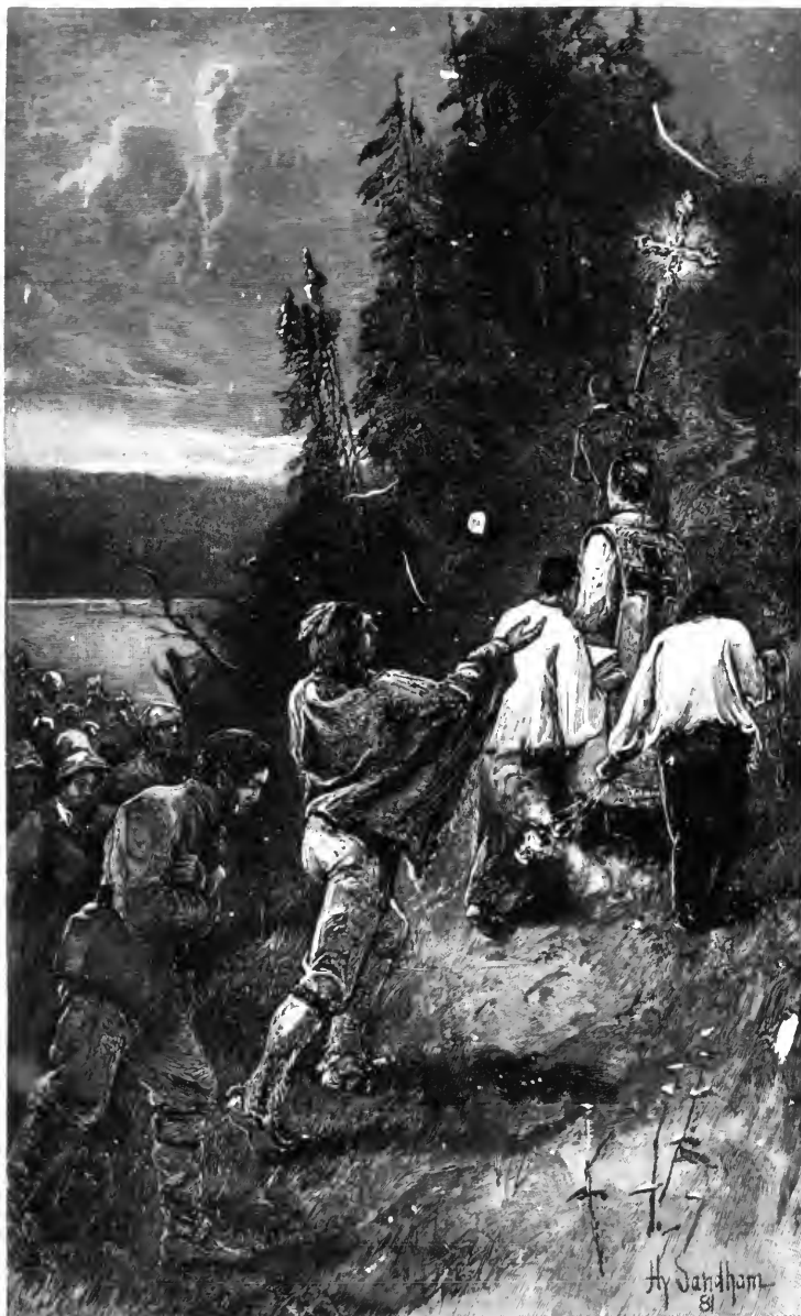
A PILGRIMAGE TWO HUNDRED YEARS AGO.

barren cause prolific. It has been the mother of great men and great nations. Little did Champlain imagine, when he prohibited the psalms of the Huguenots on the St. Lawrence, that a few more years would see the fleur-de-lis lowered forever from the city he founded; and France, once the mistress of the whole American continent north of Mexico, reduced to a few fishing-islands, equal to a